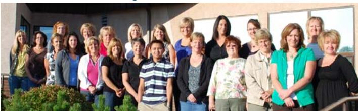
School Admin. Assistant PowerSchool Training - September PD Day